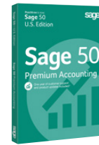
Sage 50 Premium Accounting