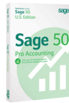
Sage 50 Pro Accounting